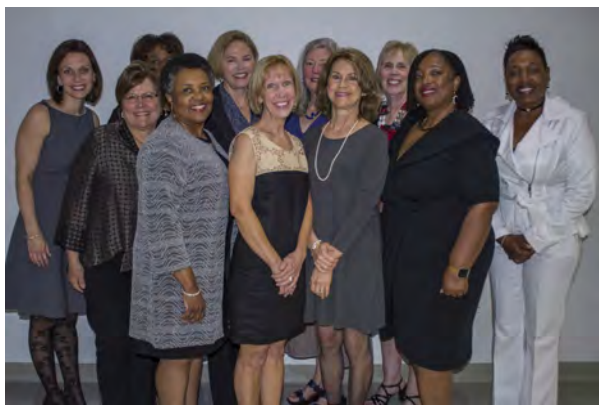
2017 Board Members